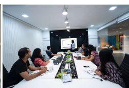
Dialogues, Briefings and Engagements