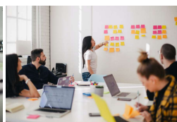
Skills Development and Training