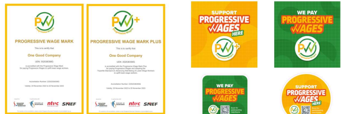
PW Mark and PW Mark Plus e-Certificates

Mark-accredited Companies Gain Access to Digital Copies of the Below Collaterals