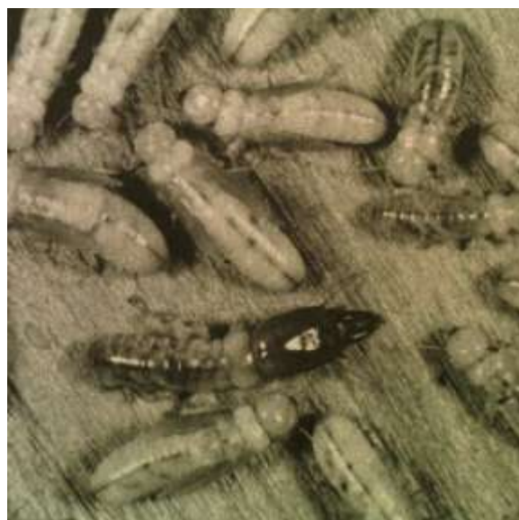
Termites are believed to be damaging buildings in Khiva, a UNESCO World Heritage Site in Uzbekistan

Uzbekistan has set up a government anti-termite agency to combat the insects' damage to the Central Asian nation.